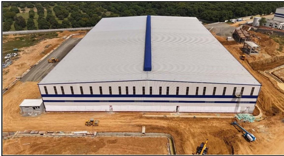
(site image of work in Progress)

Mumbai, 17th February 2025: CCI Group, India's leading 4PL Integrated Logistics and Supply Chain Company, announces an additional investment of approximately ₹640 crore in the development of a Grade-A logistics park spanning 20 lakh square feet in Phase 2, Polivakkam, Chennai. This follows the company's earlier investment of ₹250 crore in Phase 1, reinforcing its commitment to expanding world-class logistics infrastructure in the region.