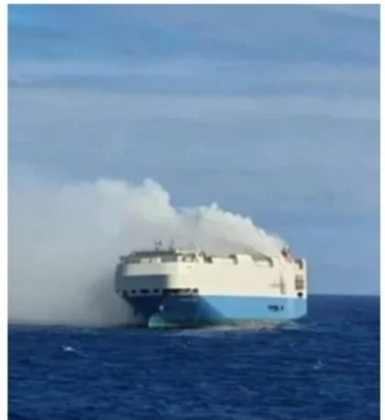
Felicity Ace Cargo

Climatic, handling and static factors in maritime, air, and road modals can affect the integrity of goods during transportation. In addition, it is necessary to check with the exporter if the goods have been properly packed for the means of transport being used.